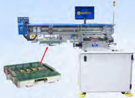
Model 903 Thermal Test System

The Copperhead routinely outperformed the competitor in thermal loss and calibration deltas.