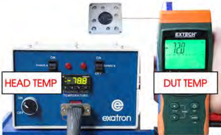
Actual Test Temperatures - QFN with Embedded Thermocouple